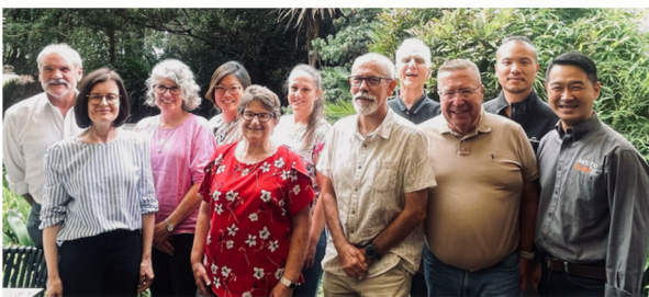
Our Jericho Road Chaplains

For Prayer Updates from Individual Chaplains